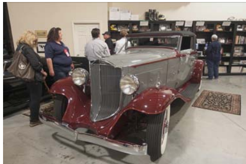
1932 Shovel Nose Packard