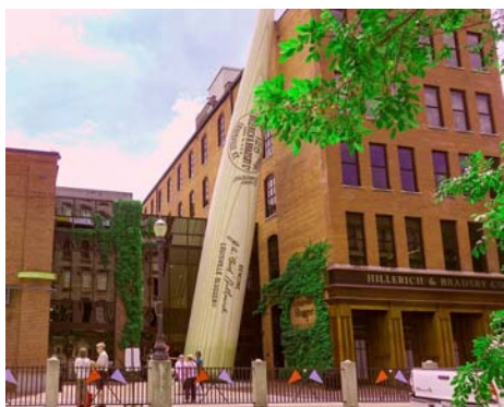
The world's largest baseball bat, 120 feet high, based on Babe Ruth's specs.

After lunch we then toured the Hillerich & Bradsby Company, home of the Louisville Slugger baseball bat. The company has a long history, stretch back to 1884. In 1905 Honus Wagner was the first baseball player to officially endorse a bat.